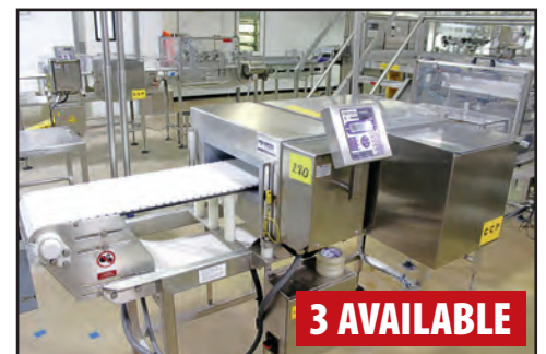
FORTRESS PHANTOM METAL DETECTOR