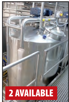
HIGHLAND STAINLESS STEEL MIXING TANK