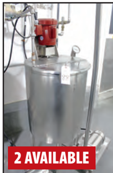
TRI-CANADA STAINLESS STEEL JACKETED MIXING TANK