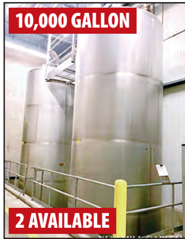
DME STAINLESS STEEL VERTICAL STORAGE TANK

HUGE QUANTITY OF STAINLESS CONVEYOR - BELT TYPES: Stainless, Banjo and Sanitary