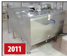
QUALTECH BUTTER MELTER