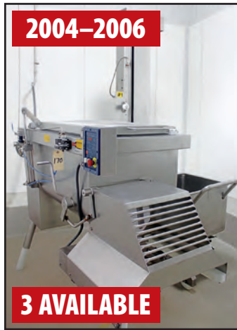
RISCO RS 450 DOUBLE SHAFT PADDLE MIXER