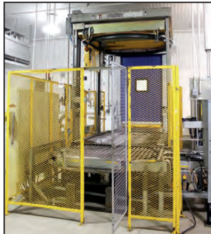
MULLER AUTOMATIC 404 OCTOPUS PALLET WRAPPING SYSTEM

To discuss your requirements for an auction, please call Perfection Industrial 847.427.3333