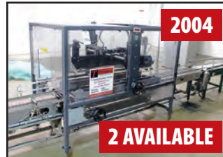
TRINAMICS TR1000TL TOP LOAD CASE PACKER