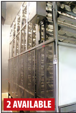
GEMINI CAROUSEL TYPE TUB PROOFER