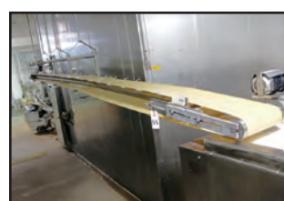
HUGE QUANTITY OF CONVEYOR - ASSORTED TYPES