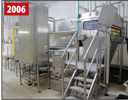
FLUIDOR EQUIPMENT SAUCE DRUM UNLOAD STATION