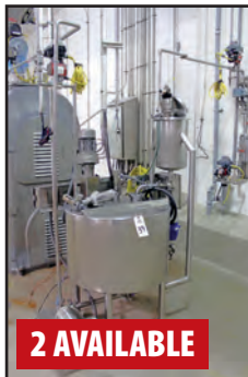
HIGHLAND YEAST MIXING STATION