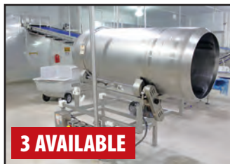
30" X 81" STAINLESS STEEL TILT FRAME DRUM TUMBLER