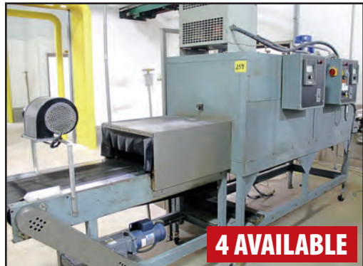
WEXXAR WF-20T CASE FORMER