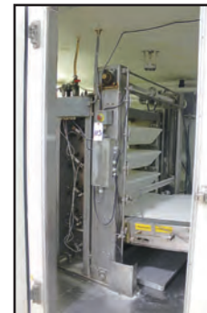
124' SINGLE PASS STAINLESS STEEL PROOFER