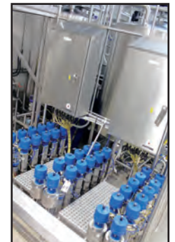
ASSORTED GEA VALVE CLUSTERS