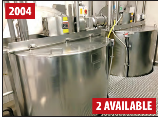
LEE INDUSTRIES 400 GALLON SCRAPE SURFACE JACKETED KETTLE